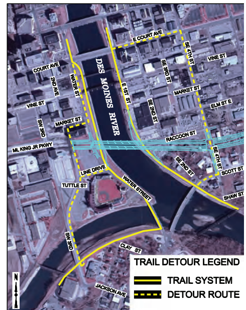
TRAIL DETOUR LEGEND TRAIL SYSTEM DETOUR ROUTE

Call, email, or write our team to get more information at any time. Additional updates will be posted on our web site, as the project moves forward.