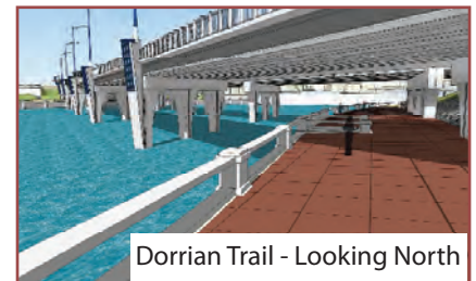
Dorrian Trail - Looking North

Construction work on the utilities (east of the river) has already begun. Work on the bridge is expected to begin in May or early June, and will continue until the spring of 2010. Street construction projects for adjoining sections of the Southeast Connector will begin in 2009 and extend for several years. (See summary on the next page.)